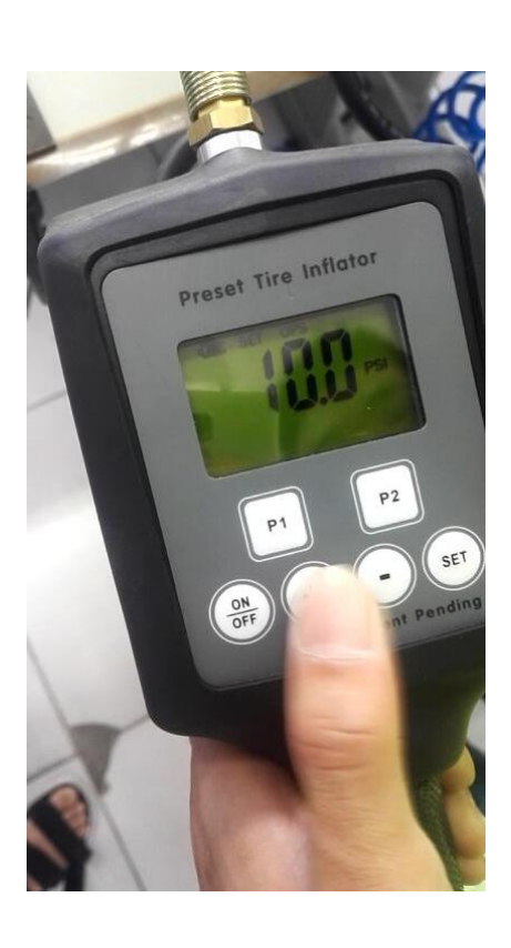
3.Press "+" to set OPS value(10psi).