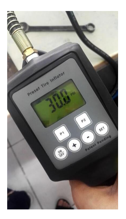
10. Then recovers to the target pressure.

After finish inflating ,the beeper alarms to remind users.