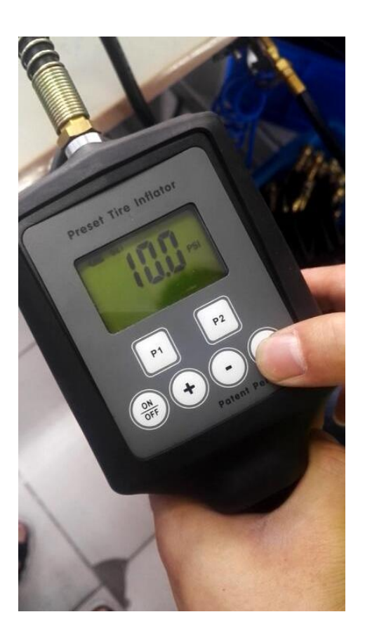
6.Press "SET" 3 times