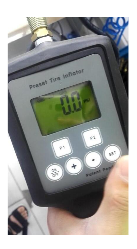
2.Press "SET" twice."OPS" flashes on screen.