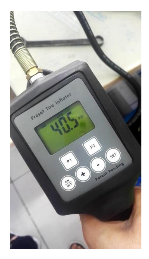
9.It inflates till the target pressure +OPS value