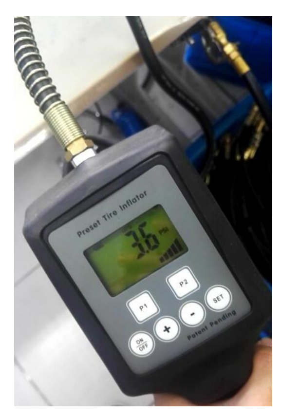
8.Bars rolling and device starts workin