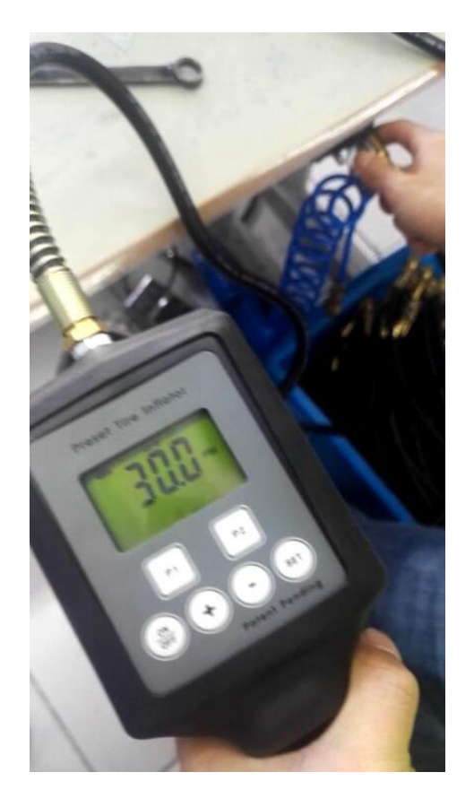
5. Connect with air source.