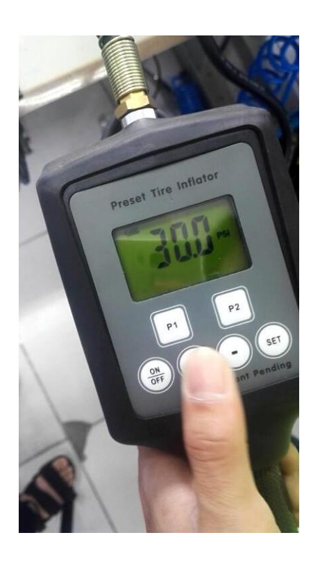
1.Turn on and set target pressure to 30 psi.